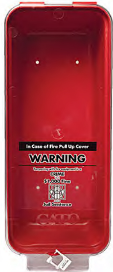
Warrior 95-10 RC

Cato's affordable fire extinguisher series, manufactured in the U.S, provides a dent and rust proof alternative to metal. Cato's Warrior series fire extinguisher cabinet is a two- piece construction with a locking seal. No additional padlock is required. Simply pull up to break the seal and remove the cover to access extinguisher inside.